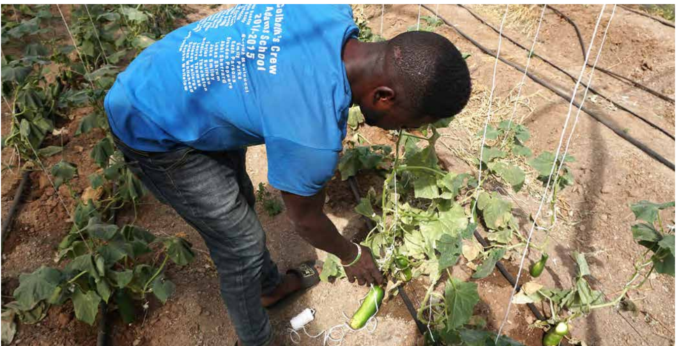
Small scale green house vegetable farming in Africa, Karshi, Nigeria. December 2018.