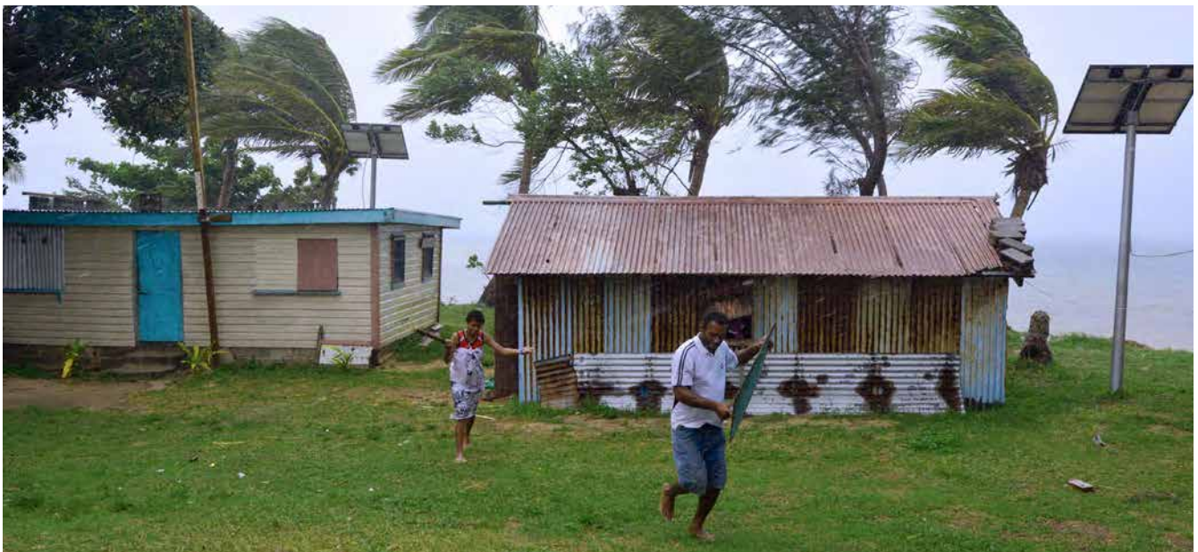
Fijian people run to get shelter during a Tropical Cyclone Winston, Yasawa Islands, Fiji. December 2016.