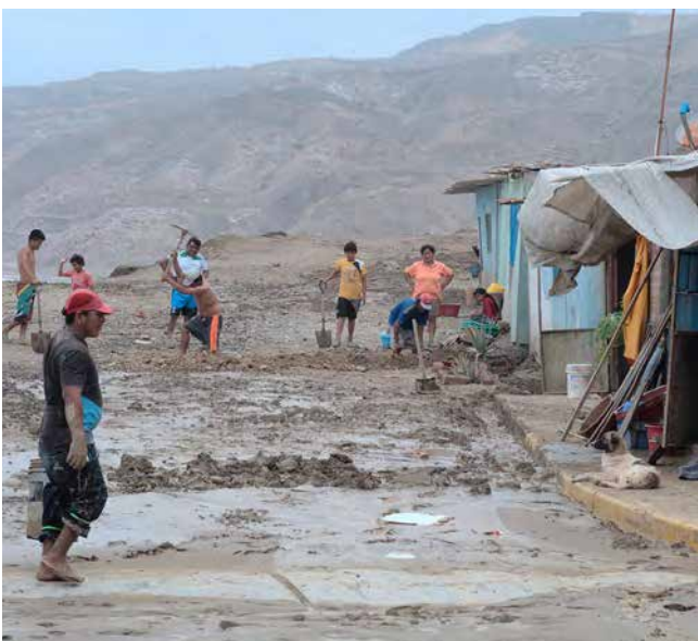
Fishing village residents work to clean their town of mud after flooding brought on by El Niño rains, Cabo Blanco, Peru. February 2017.

› Following natural disasters like the tsunami of 2004 or droughts and floods, the Central Bank of Sri Lanka has put moratoriums on loan repayments for affected borrowers. Banks are also required to provide or facilitate emergency credit after a climate-related disaster, including reconstruction mortgages for