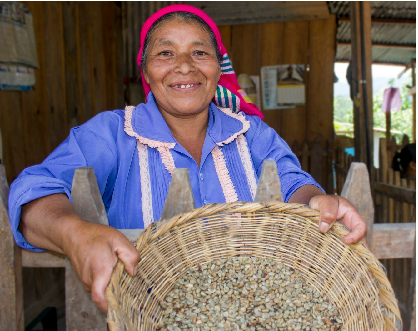
Female MSME cleaning coffee beans.