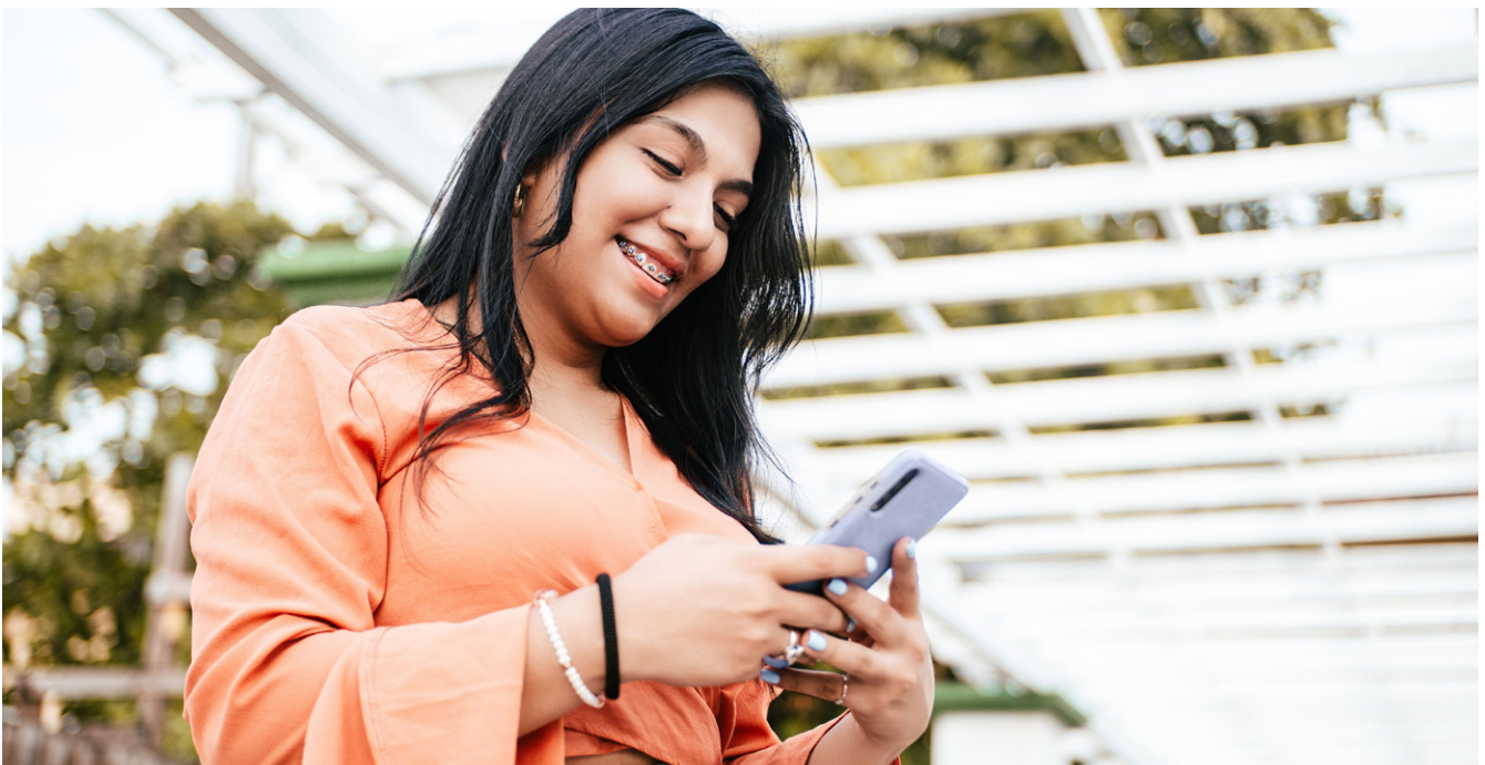
Young female using digital technology.