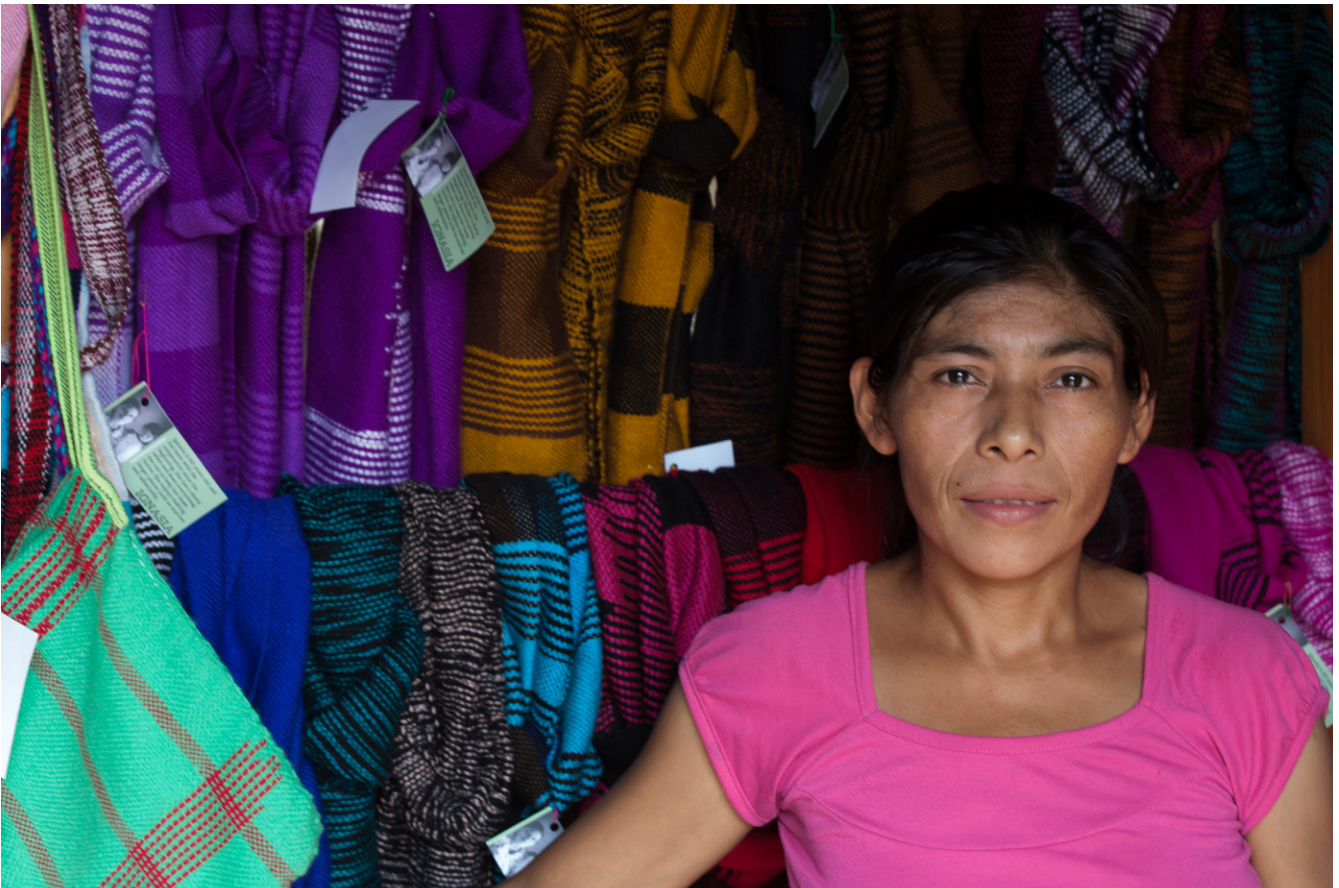
Female stallholder.