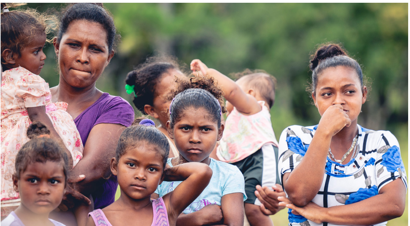
Village community group.