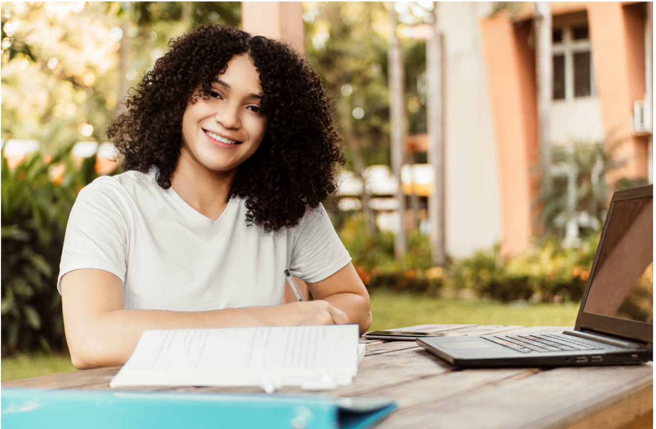
Female student with digital technology.

On the other hand, Tingo, the other major e-money provider, requires a smartphone application, which restricts the potential user base to those with a smartphone and mobile Internet connectivity and as thus is likely to build in a gender bias towards serving men from the start.