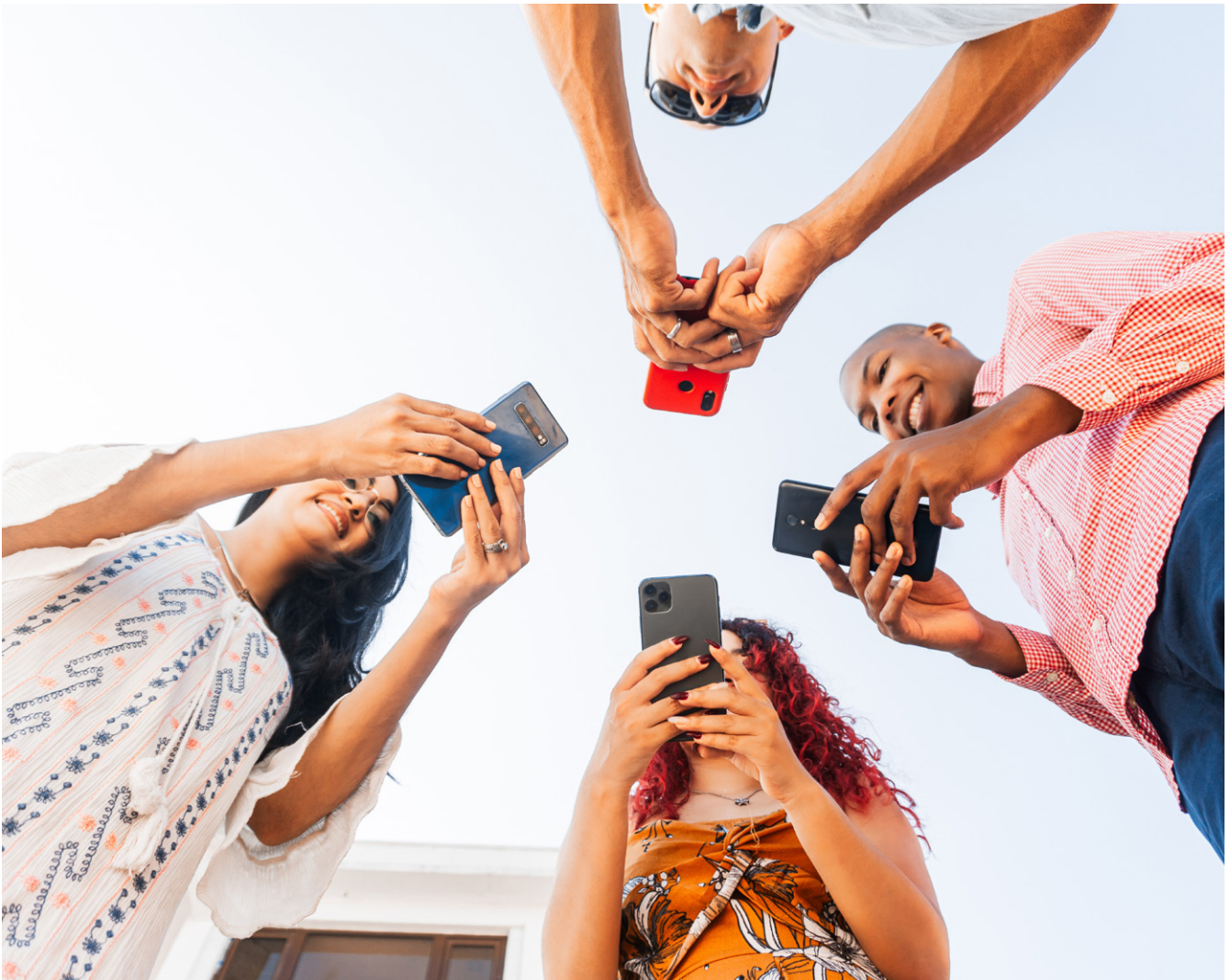
Group of female and male friends using smartphones.