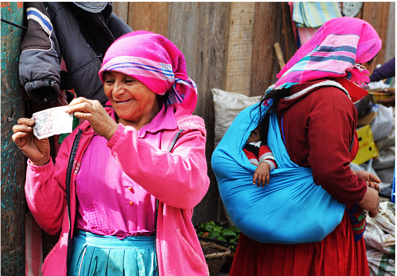
Sunday market in La Esperanza.